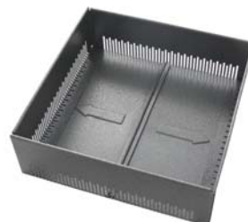
Pull out flange - inside the chamber for easy transportation and storage