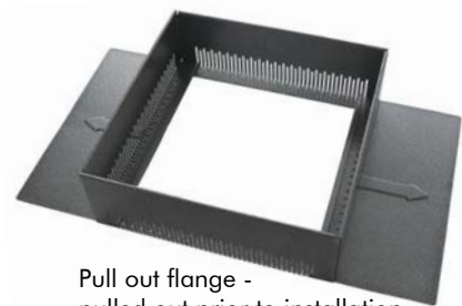
Pull out flange - pulled out prior to installation