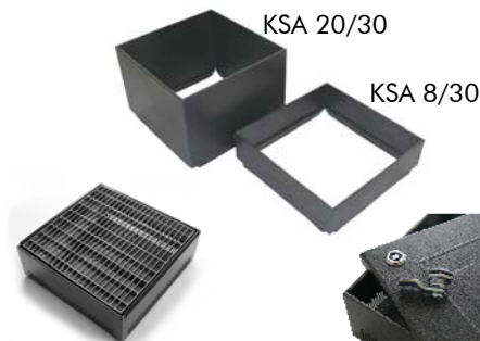
alternatively available with galvanized grill

Inspection chamber for protection and inspection of roof outlets for extensive green roofs and gravel roofs, with extension pieces also suitable for intensive green roofs.