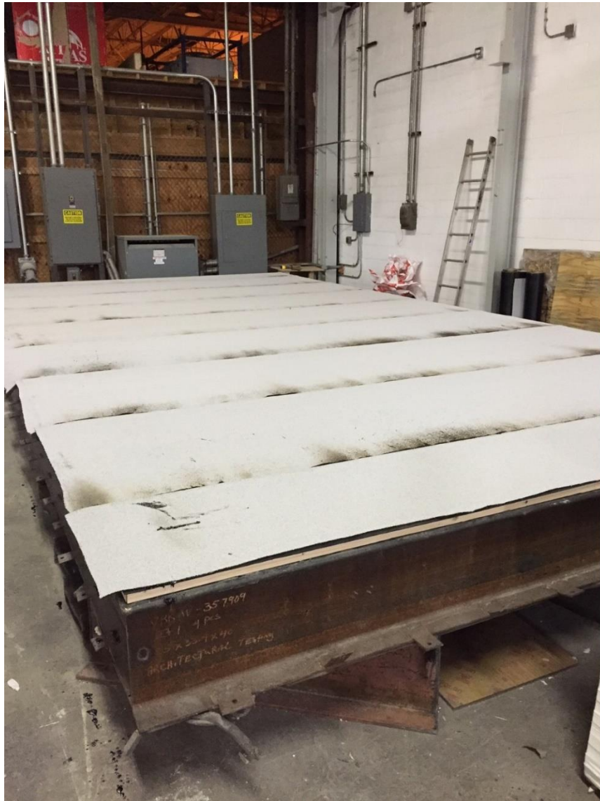
Photo No. 1 Roof Assembly