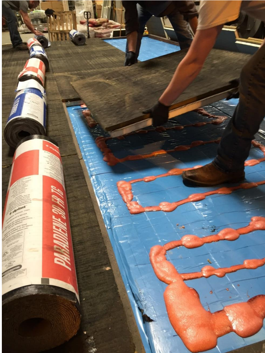
Photo No. 3 Polyiso/Roxul Layers Adhered with Parafast/Olybond