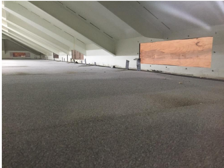
Photo No. 5 Loss of Adhesion Failure