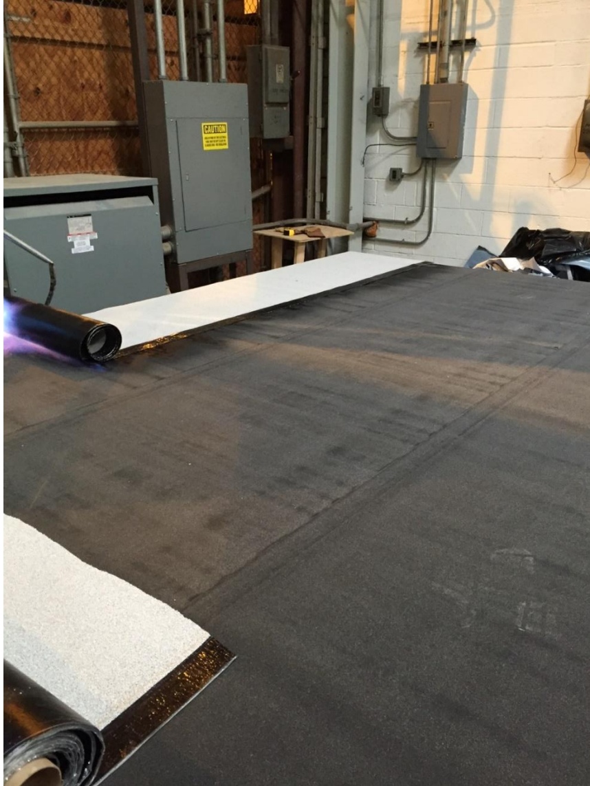
Photo No. 4 Torched Base Sheet and Torched Cap Sheet