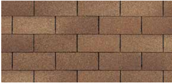
Desert Tan †/**