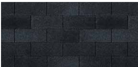
Onyx Black †