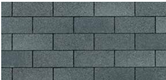
Estate Gray †