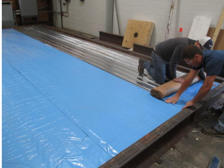
Photo No. 3 Vapor Shield