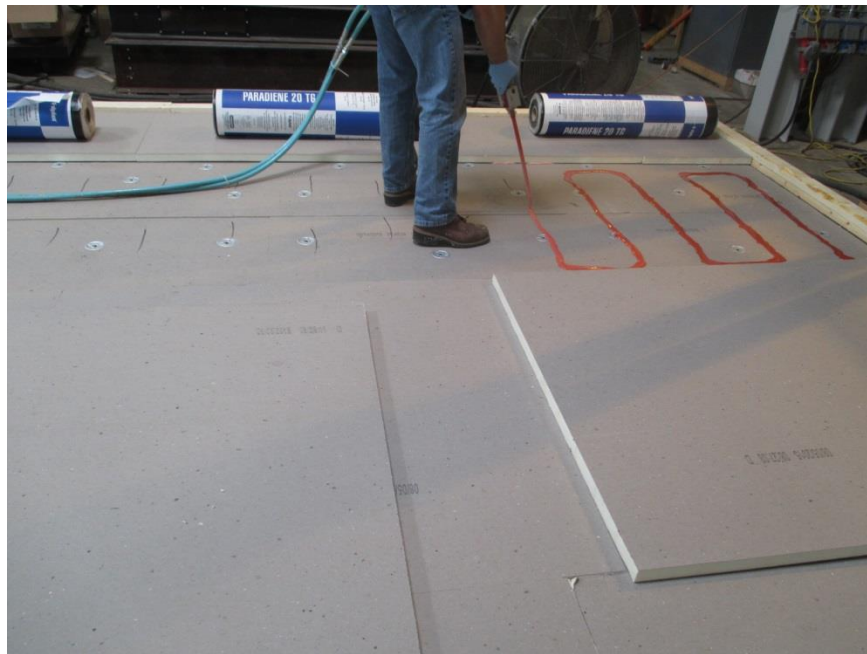
Photo No. 4 Polyiso Layers Mechanically Attached and Adhered with Parafast/Olybond