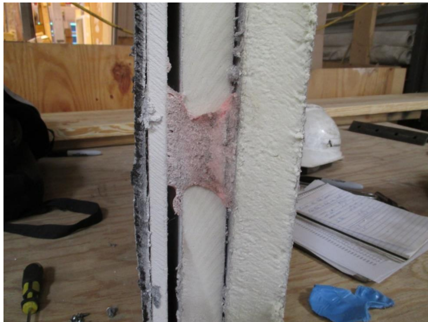
Photo No. 2 Cross-Section of Roof Buildup