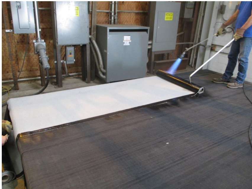
Photo No. 6 Self-Adhered Base Sheet and Torched Cap Sheet